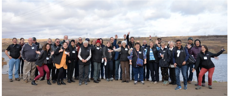
“Finding Common Ground” Tour participants visit the coal and natural gas-fired Battle River Generating Station

Energy systems and climate adaptation have also been central priorities for the BRWA over the past several months. In October 2019, we hosted our second “Finding Common Ground” Tour in the Battle River watershed. The purpose of this bus tour was to explore the diversity of energy systems and climate adaptation projects currently taking place across the watershed, and provide a mechanism for participants to share their knowledge and experiences with other people in their networks. The BRWA has also begun working with the City of Camrose’s Green Action Committee to put together a series of public engagement events on the topics of climate adaptation and action. The intent of these events is to build a shared knowledge base to support the development of a climate action plan for the City.